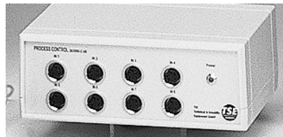
Control unit – 8-channels