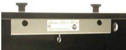
Sensor mounted to housing

In the single-channel basic configuration a measuring station consists of: